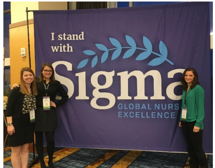
Nursing students represented the Beta Kappa chapter by presenting their research and attending lectures/sessions.